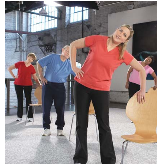
Arthritis Foundation Exercise Program