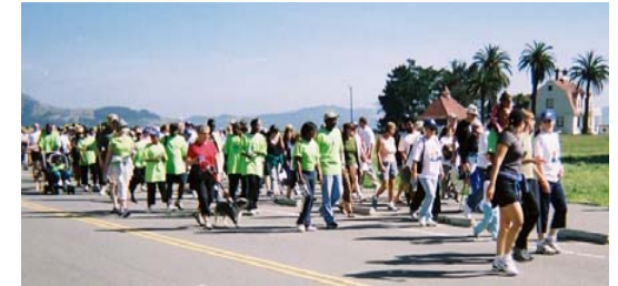
Arthritis Walk, Crissy Field