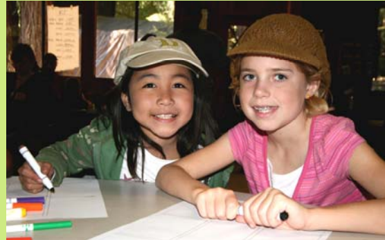
Juvenile Arthritis Summer Camp

The Arthritis Foundation is grateful to all for your generous support. Donations are used to fund research and to provide programs and services that make positive differences in people's lives. We pledge our continued commitment to effectively and efficiently steward your contributions.