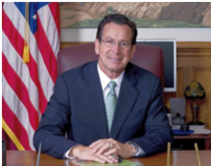
Connecticut Governor Dannel Malloy

The Arthritis Foundation has been working to ensure that people with arthritis have access to vital, life-improving treatments. Because of our efforts, Connecticut Governor Dannel Malloy signed Senate Bill 394 into law to bar health insurers that use step therapy protocols from requiring their use for more than 60 days and providing doctors with a method to override the protocol.