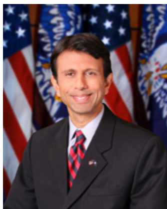
Louisiana Governor Bobby Jindal

Under a new law advocated by the Arthritis Foundation and signed by Louisiana Governor Bobby Jindal, the maximum co-payment or coinsurance for up to a 30-day supply of any single drug may not exceed $150 per month beginning January 1, 2015.