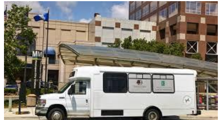
Free hotel shuttle